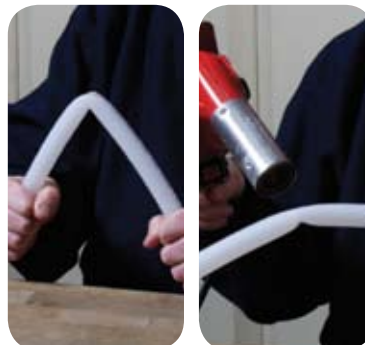
Kinks in Uponor PEX are easily repaired with a heat gun.

Only high-performance manufacturing can deliver a high-performance product.